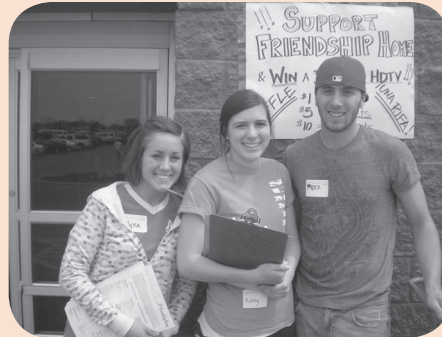
Wesleyan students help Stuff the Bus

raffle ticket sales, and cash donations $28,000 was raised to help support the women and children at Friendship Home.