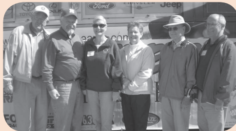
Northeast Kiwanis members

Aided by the committed Deejays from Three Eagles stations (1240AM KFOR, 106.3 KFRX, KX 96.9, 92.9 The Eagle, ESPN 1480, and 104.1 The Blaze), Volunteers loaded items onto the busses all weekend and heard many stories of women who used the services of Friendship Home and are now safe.