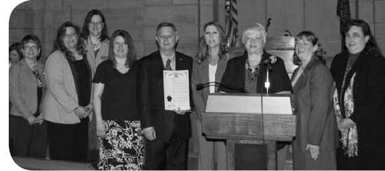
Members of the International Association of Administrative Professionals

The International Association of Administrative Professionals held their annual conference April 20th. The group held a raffle for Friendship Home and made an additional donation from the organization.