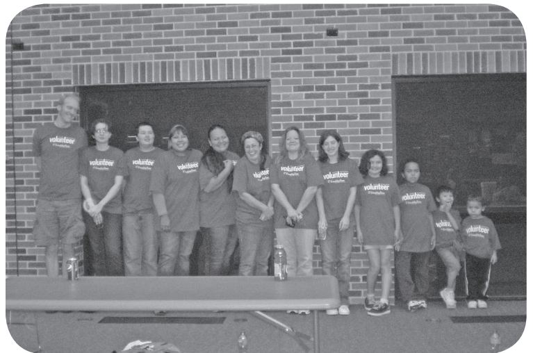
2010 Safe Quarters Team Young

Welcome Friendship Home Safe Quarters volunteers on October 2 and help us continue this tradition.