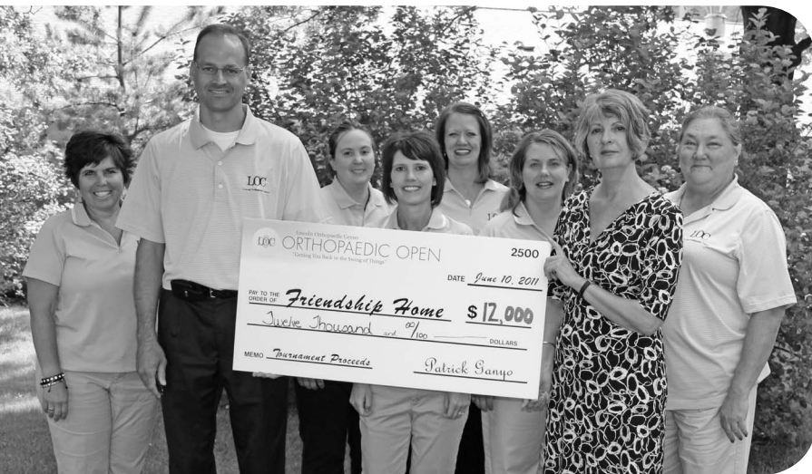
Lincoln Orthopaedic Center Presents Check at Ortho Open