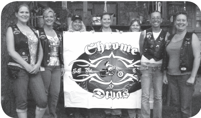
Chrome Divas Southeast Nebraska Chapter

Each woman in the Chrome Divas Southeast Nebraska Chapter has her own story. Many have domestic violence in their past. A couple have stayed at Friendship Home or other domestic violence shelters in Nebraska. All of them are dedicated to making sure other women and children have a safe place.