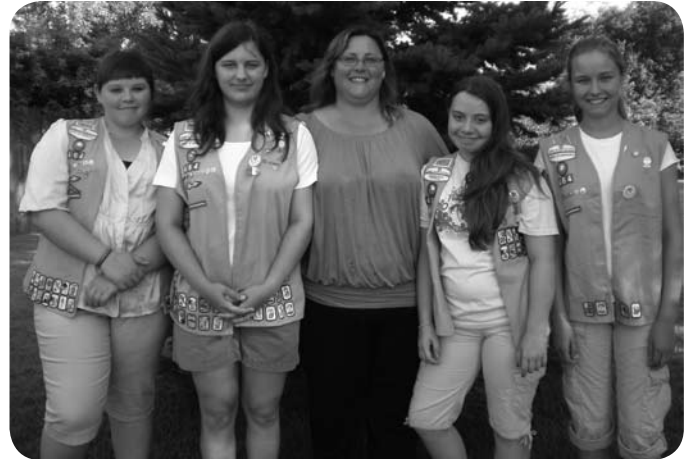
Girl Scout Troop #464

Girl Scout Troop #464 is made up of only four members, but it didn't stop them from making a big impact. The Troop traveled door to door, collecting funds and items for Friendship Home. St. Luke United Methodist Church held their Christmas in July items drive collecting cleaning products for the shelters. Red was the color of choice for the items collected by the Lamplighters Circle at Bennett Community Church . Footloose and Fancy held a promotion and donated hundreds of pairs of shoes to women and children at Friendship Home. The flowerbeds at shelter are still blooming thanks to Melichar 66 Services . Owner, Bruce Melichar donated flats of bedding plants for a cheerful shelter. First-Plymouth Congregational Church and Verizon Wireless employees collected back to school items so the kids at Friendship Home would have an easy transition. New recruits to the University of Nebraska-Lincoln Greek system brought personal care items for the women at Friendship Home during their rush week.